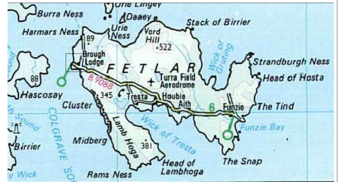
Location plan scale n/a